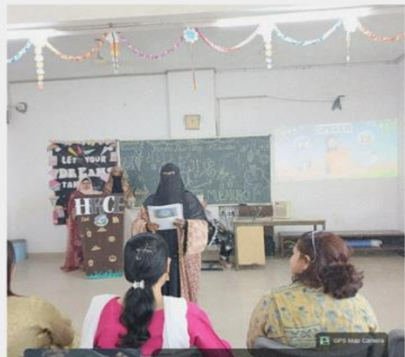
GPS Map Camera