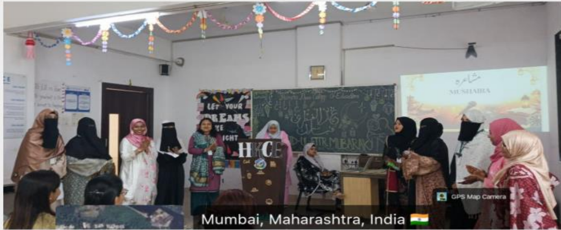
Mumbai, Maharashtra, India 🇮🇳