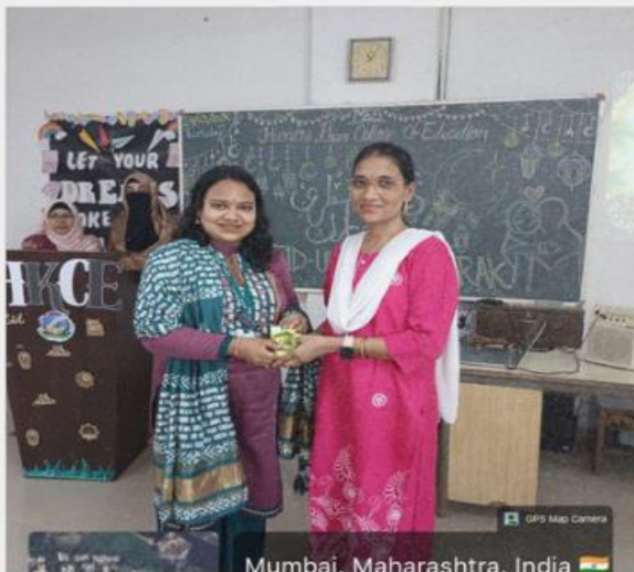
Mumbai, Maharashtra, India 🇮🇳