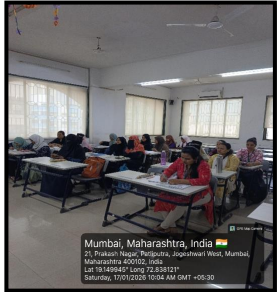
Mumbai, Maharashtra, India 🇮🇳 21, Prakash Nagar, Patiputra, Jogeshwari West, Mumbai, Maharashtra 400102, India Lat 19.149945° Long 72.838121° Saturday, 17/01/2026 10:04 AM GMT +05:30