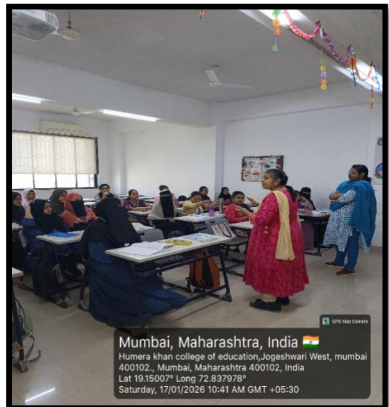
Mumbai, Maharashtra, India 🇮🇳 Humera khan college of education, Jogeshwari West, mumbai 400102, Mumbai, Maharashtra 400102, India Lat 19.15007° Long 72.837978° Saturday, 17/01/2026 10:41 AM GMT +05:30