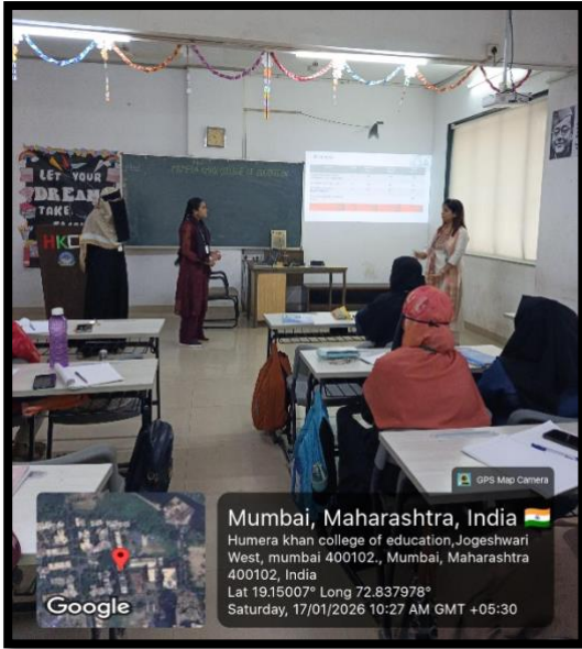
Mumbai, Maharashtra, India 🇮🇳 Humera khan college of education, Jogeshwari West, mumbai 400102, Mumbai, Maharashtra 400102, India Lat 19.15007° Long 72.837978° Saturday, 17/01/2026 10:27 AM GMT +05:30

Email: principal@hkce.edu.in Website: www.hkce.edu.in