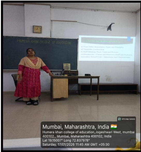
Mumbai, Maharashtra, India 🇮🇳 Humera khan college of education, Jogeshwari West, mumbai 400102, Mumbai, Maharashtra 400102, India Lat 19.15007° Long 72.837978° Saturday, 17/01/2026 11:45 AM GMT +05:30