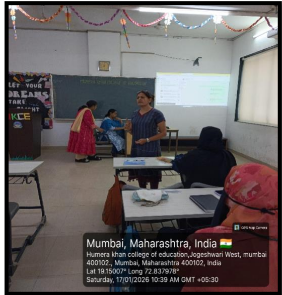
Mumbai, Maharashtra, India 🇮🇳 Humera khan college of education, Jogeshwari West, mumbai 400102, Mumbai, Maharashtra 400102, India Lat 19.15007° Long 72.837978° Saturday, 17/01/2026 10:39 AM GMT +05:30