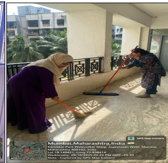
Mumbai, Maharashtra, India Kamlakar Pant Walawalkar Marg, Jogeshwari West, Mumbai, Maharashtra 400102, India Lat 19.149421, Long 72.838414 Wednesday, 29/10/2025 02:22 PM GMT+05:30 Note : Captured by GPS Map Camera