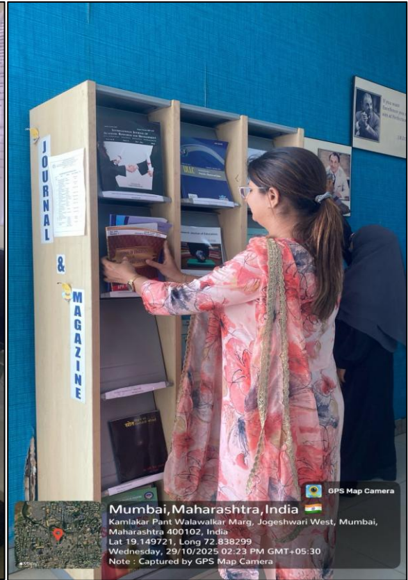
Mumbai, Maharashtra, India Kamlakar Pant Walawalkar Marg, Jogeshwari West, Mumbai, Maharashtra 400102, India Lat 19.149721, Long 72.838299 Wednesday, 29/10/2025 02:23 PM GMT+05:30 Note : Captured by GPS Map Camera