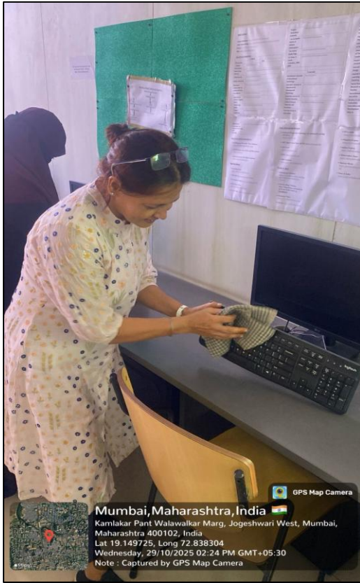
Mumbai, Maharashtra, India Kamlakar Pant Walawalkar Marg, Jogeshwari West, Mumbai, Maharashtra 400102, India Lat 19.149725, Long 72.838304 Wednesday, 29/10/2025 02:24 PM GMT+05:30 Note : Captured by GPS Map Camera