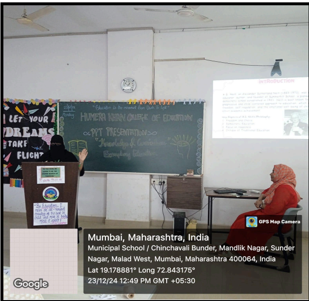
Mumbai, Maharashtra, India Municipal School / Chinchavali Bunder, Mandlik Nagar, Sunder Nagar, Malad West, Mumbai, Maharashtra 400064, India Lat 19.178881° Long 72.843175° 23/12/24 12:49 PM GMT +05:30