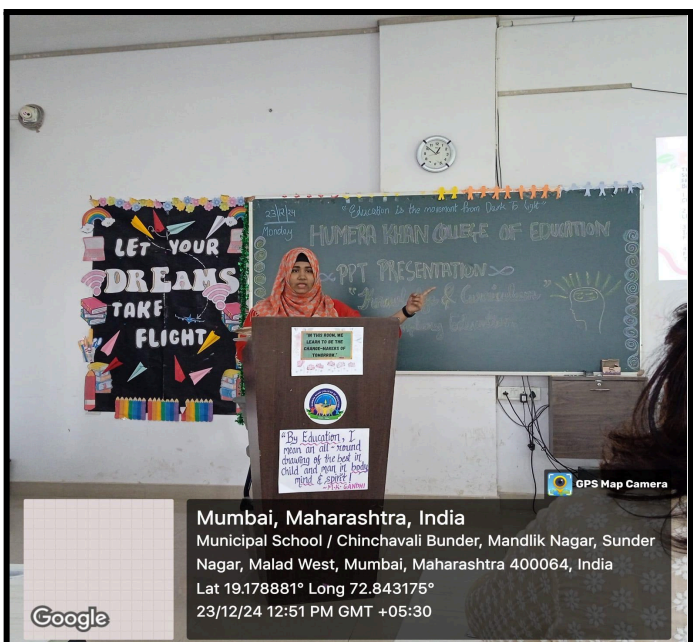
Mumbai, Maharashtra, India Municipal School / Chinchavali Bunder, Mandlik Nagar, Sunder Nagar, Malad West, Mumbai, Maharashtra 400064, India Lat 19.178881° Long 72.843175° 23/12/24 12:51 PM GMT +05:30