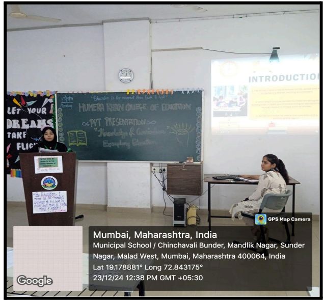
Mumbai, Maharashtra, India Municipal School / Chinchavali Bunder, Mandlik Nagar, Sunder Nagar, Malad West, Mumbai, Maharashtra 400064, India Lat 19.178881° Long 72.843175° 23/12/24 12:38 PM GMT +05:30