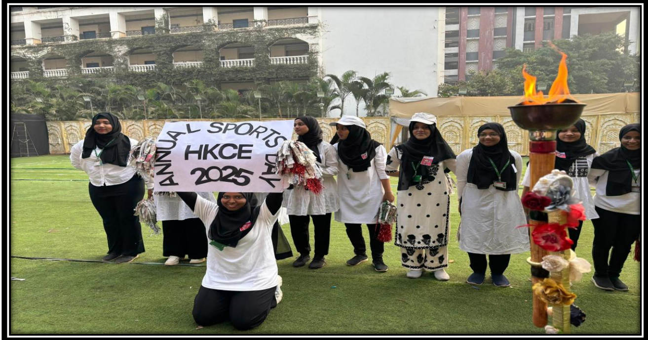
Arrival of Guest and group Presentation