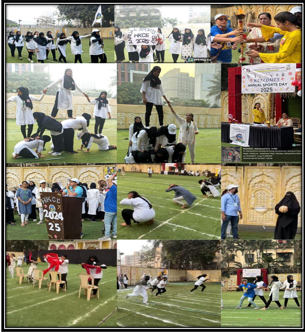
Memorable Sports Moments

H.K CAMPUS, Adjacent to MHADA Complex, Pratiksha Nagar, Oshiwara, Jogeshwari (W) Affiliated to University of Mumbai & Approved by NCTE (NCTE Code No: 123082) Tel (022)26776221, Fax: (022)26790095 Email: principal@hkce.edu.in Website: www.hkce.edu.in